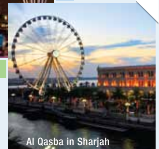
Al Qasba in Sharjah

DUBAI: This is the most vibrant emirate of UAE and summarises the ambitious attitude of UAE. Dubai's cosmopolitan flavor is matched by the city's many restaurants and entertainment venues, which provide a truly international array of choices for the visitor. Dubai has a year-round sunny climate with rain a very rare occurrence, happening only a few times a year. Dubai is also famously known for its Shopping Experience.