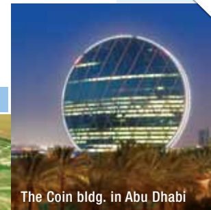
The Coin bldg. in Abu Dhabi