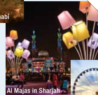
Al Majas in Sharjah